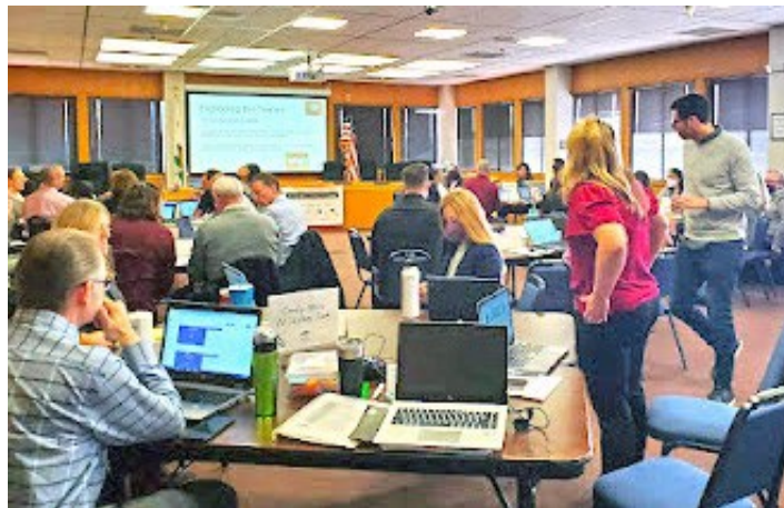
Curriculum Council Members explore the 2022 CA Dashboard Communications Toolkit, developed by CDE.