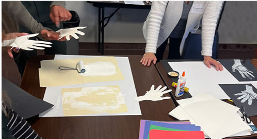
The Center for Community Arts engaged arts leaders in a printmaking lesson using paint, brayers, file folders and construction paper.