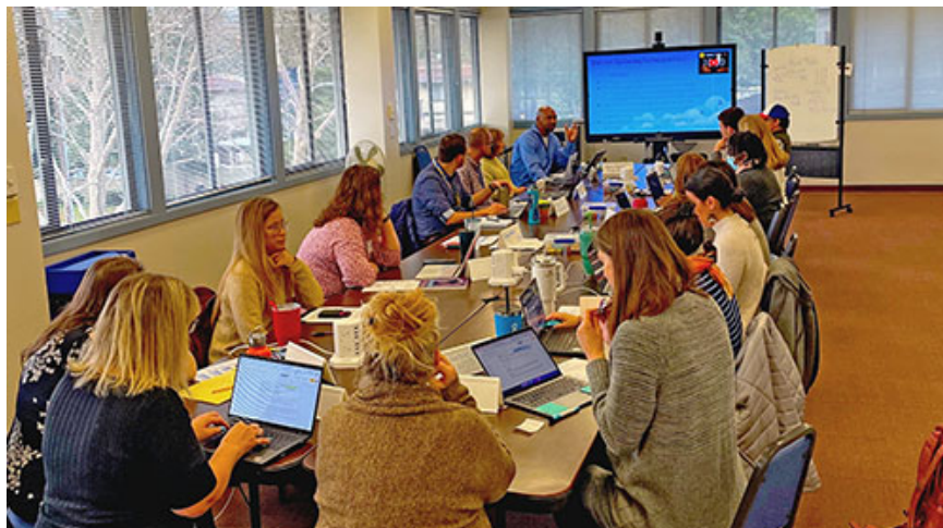
Math Subcommittee members collaborate and share district updates.